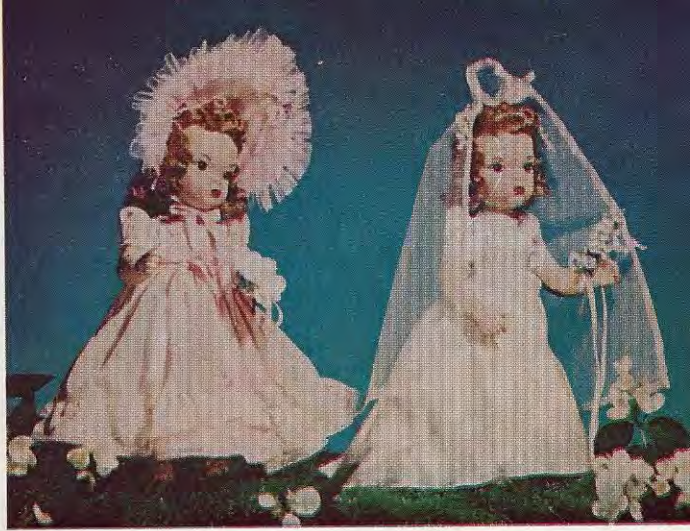
80B Terri as Bridesmaid