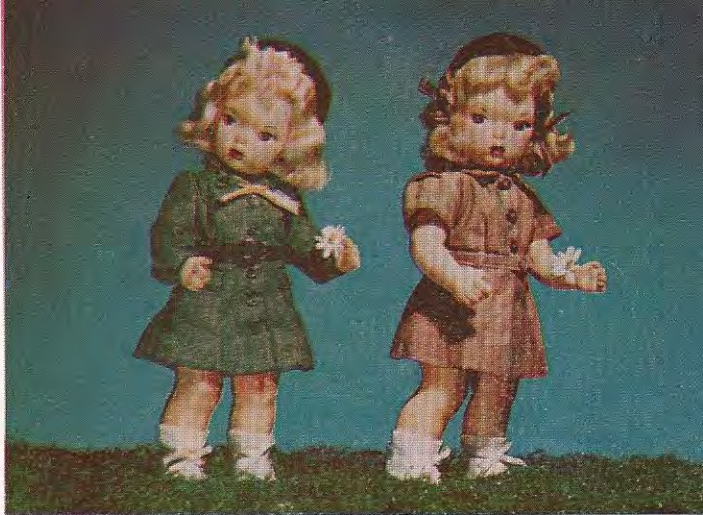
30 Terri in Girl Scout uniform