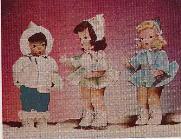
800 Nanook 100 Terri in Ice Skating Costume Page 21

1075 Ballerina costume 1081 Roller Skating costume