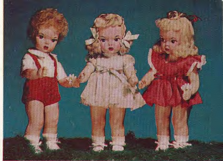
200 Jerri in Short Pants and Shirt 10C Terri in Party Dress 10B Terri in Pinafore Page 7

1071 Scotch Costume 1073 Plaid Skirt and Blouse 1072 Jumper Costume