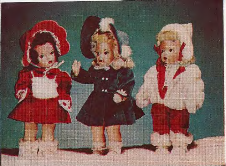
Page 160 Terri in Coat, Bonnet, Mittens, Muff & Galoshes 8 180 Terri in Coat and Bonnet only 170 Terri in Snow Suit